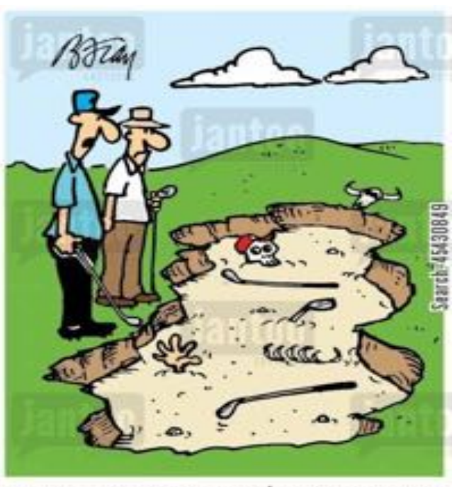
"TOUGHEST SAND TRAP I'VE EVER SEEN!"