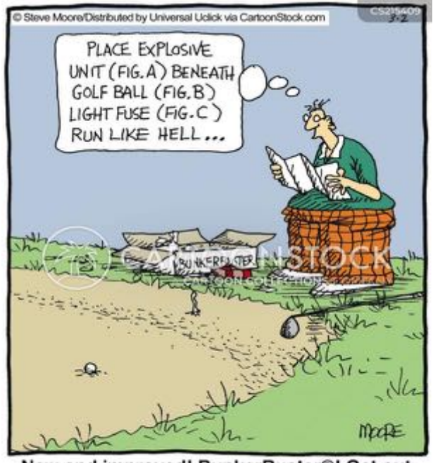
New and improved! BunkerBuster®! Get out of the sand trap every single time – or your money back!!