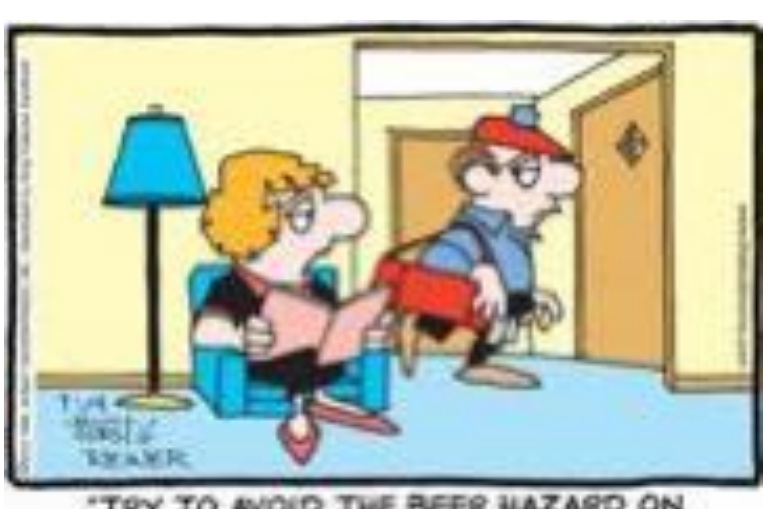
TRY TO AVOID THE BEER HAZARD ON THE NINETEENTH HOLE."