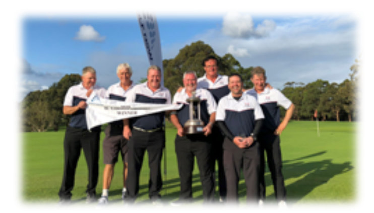
2018 Gibson Trophy winners, The Coast GC (It could be us!!)

To be eligible to play in the Warren team, your Golflink handicap must not fall below 11.0 between 1 January and 30 June this year. To be eligible to play Gibson, your Golflink handicap must not have been below 17.0 between 1 January and 30 June this year.